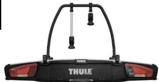
THULE VELOSPACE XT2 938 BICYCLE-CARRIER